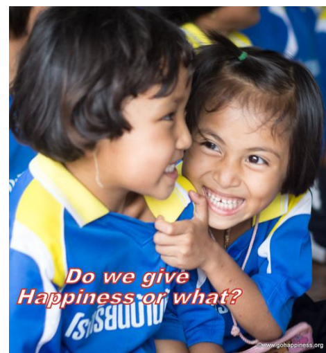
Good news for poor kids in Thailand!

All the people we visit are living in very poor or desperately poor situations and we are always prepared to experience some sights that may be uncomfortable, but we are determined to keep doing this important work as often as possible.