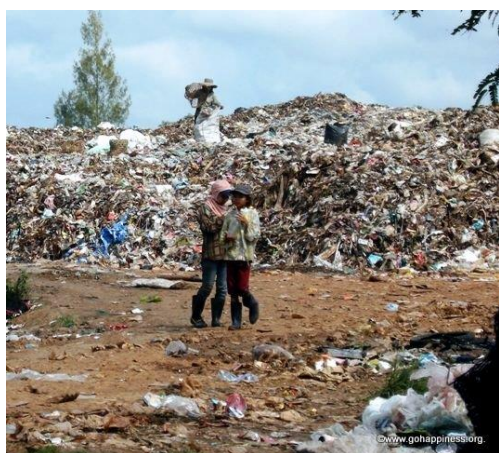
Kids who live on the dump surrounded by their own brand of Christmas presents!

Gift of Happiness Foundation fulfilled its commitment to assist more than 1,000 needy people in Thailand during January 2015. We plan to keep our little charity moving onwards and upwards throughout 2015 and sincerely hope to receive a good level of assistance from friends of the Foundation to help us help the children and people we serve as much as possible.