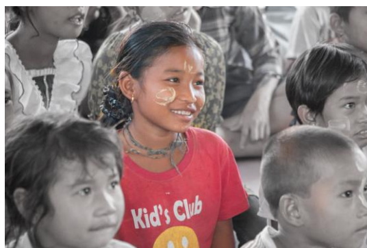
Clothing given on every GoHF visit here.