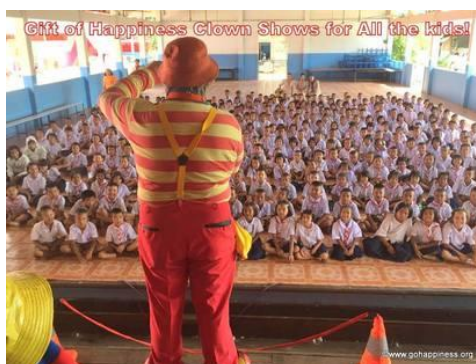
The back side of the show!