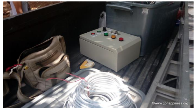
Lots more electrical equipment needed to power the pumps.