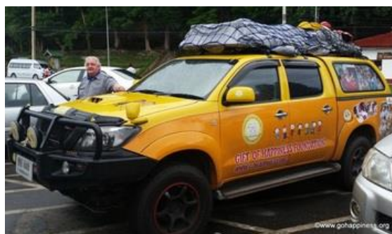
Gift of Happiness Foundation Director's own truck being put to good use again!