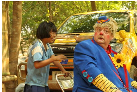
Gift of Happiness Foundation - Giving Just What it Says on the Tin!

This five day aid and show giving tour included visits to six migrant schools in communities close to the Thai Burma border, but within 50 kilometers of Sangkhlaburi, north Thailand. We also visited a safe house for abused women and children before we returned to Bangkok on Friday 19 June.