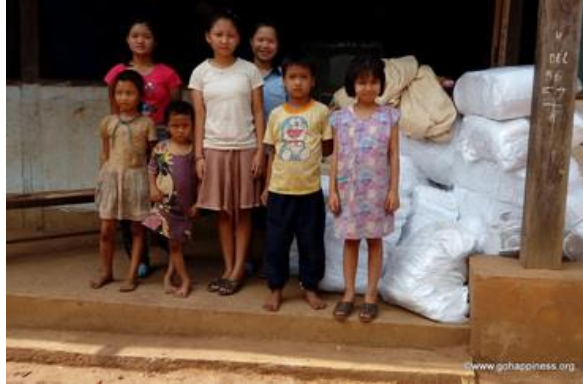
New bedding and towels and Pasta for kids living in basic village dormitories