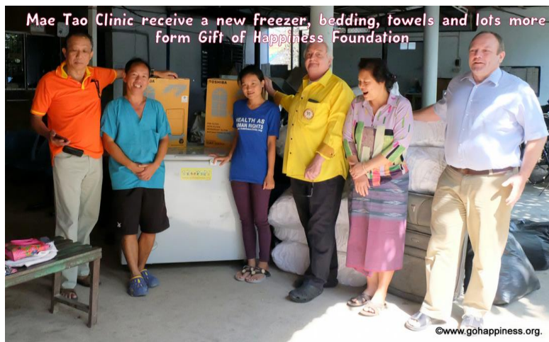
GoHF gives to Mae Tao Clinic almost every month. This time it was a much-needed Freezer and other essentials.

The charity paid it's usual monthly visit to Mae Tao Clinic to give them this month's donations of essential goods that helps keep the whole clinic functioning and providing medical care to thousands of people every month of the year. This month we gave them a new chest freezer for safe storage of important medical supplies and drugs, plus a couple of very useful air cleaning/filtering machines for the surgical rooms, a large donation of towels, bedding, slippers, adult clothing and even a load of used bags to hand out to the many out-patients attending the clinic every day.