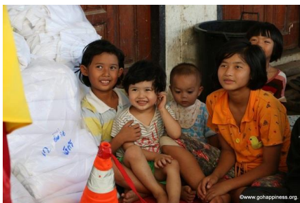
Orphans receive clean, soft bedding and towels from Park Plaza Sukhumvit Hotel, Bangkok.