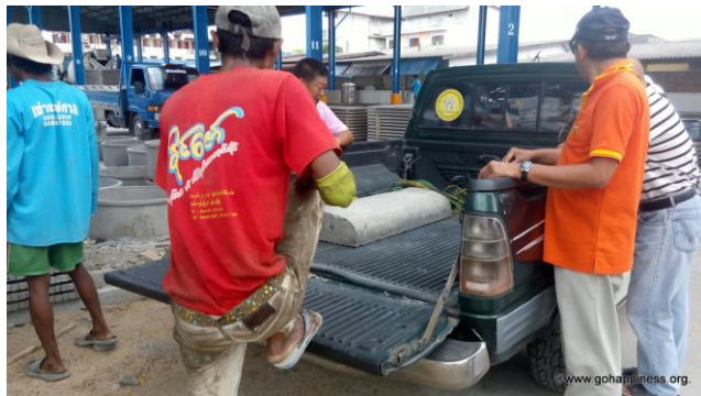
Last minute shopping for the concrete water pump base.