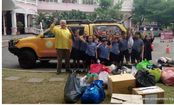
Thank you to the children and teachers at Charter International School, Bangkok!

Then, on Saturday 25 th , we attended the Annual St. Georges Society Ball, where the society raised funds for our charity. This is a fantastic night of very British frivolity and mayhem in Bangkok!