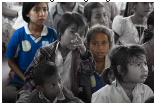
Gift of Happiness uniforms worn for the show.

Some of the children are wearing uniforms that GoHF gave them three years ago. Most of the children are wearing clothing we gave them during our last visit in 2013.