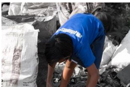
Back to work as usual on the dump after the show.