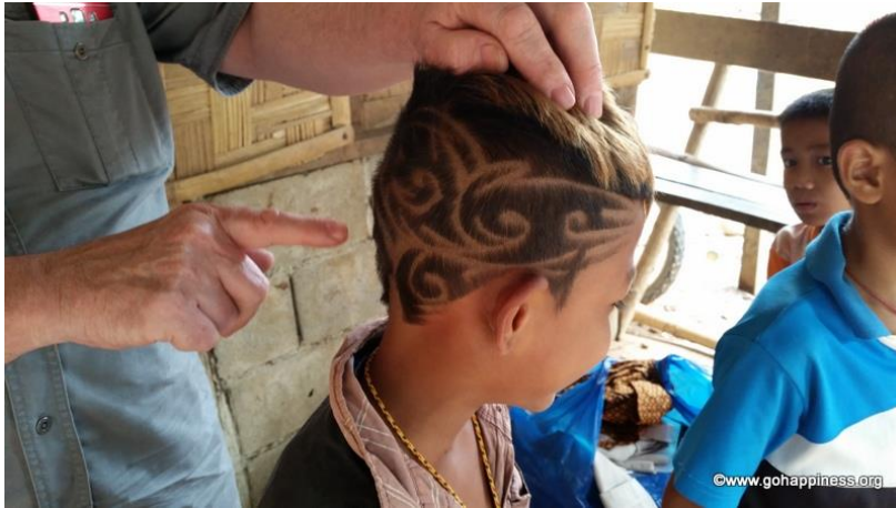
Musical notes/patterns shaved into his hair at an ethnic Mon squatter village