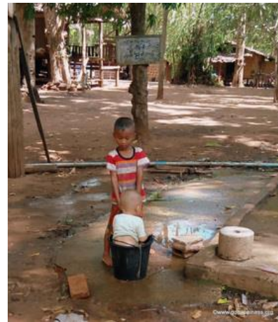
Now they can have running water to bathe in.