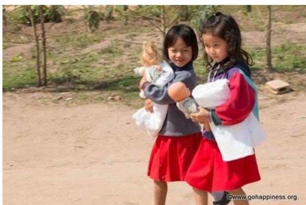
Every child received new towels, toys and more from Gift of Happiness Foundation.

This Gift of Happiness aid and show giving project supported 100 children and teachers at the Sky Blue Migrant School at the garbage dump. The Foundation also supported people living on the garbage dump located very close to the school, as well as 250 children, teachers and local community members at the Kwe Ka Baw high school, near Mae Sot.