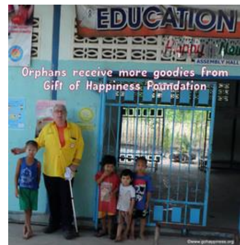
Giving again to AGAPE Orphanage near Mae Sot.

The charity was also happy to give around 50 kilo's of top quality Italian Pasta (donated by Eurofoodthai.com Bangkok ) to AGAPE Orphanage and around the same amount of pasta went to the boys and girls dormitories in the Village where the water pump project took place. We also gave a load of linen, towels and soft shoes for the children to use in their dormitories.