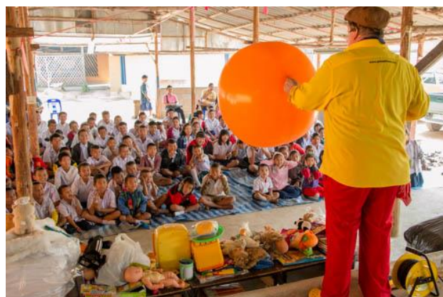
Just a few of the 1,000 happy people in January 2015.