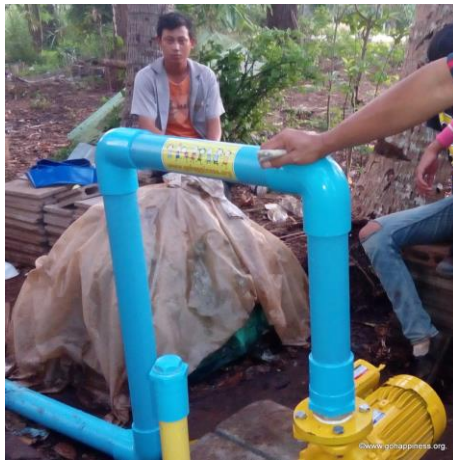
Installation of the new water pumping system.