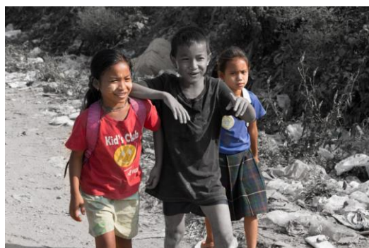
Chattering as they head home after school. (Home?)

This Gift of Happiness aid and show giving project supported 100 children and teachers at the Sky Blue Migrant School at the garbage dump. The Foundation also supported people living on the garbage dump located very close to the school, as well as 250 children, teachers and local community members at the Kwe Ka Baw high school, near Mae Sot.